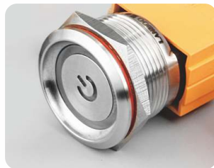
凹面设计, 贴合手指 Concave Design / Easy to press