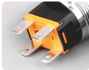
加粗镀银插脚, 大电流 Bold Silver plated Pins, High-Current