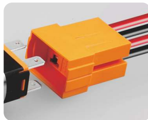
可配插件, 塑料件均阻燃 Connector